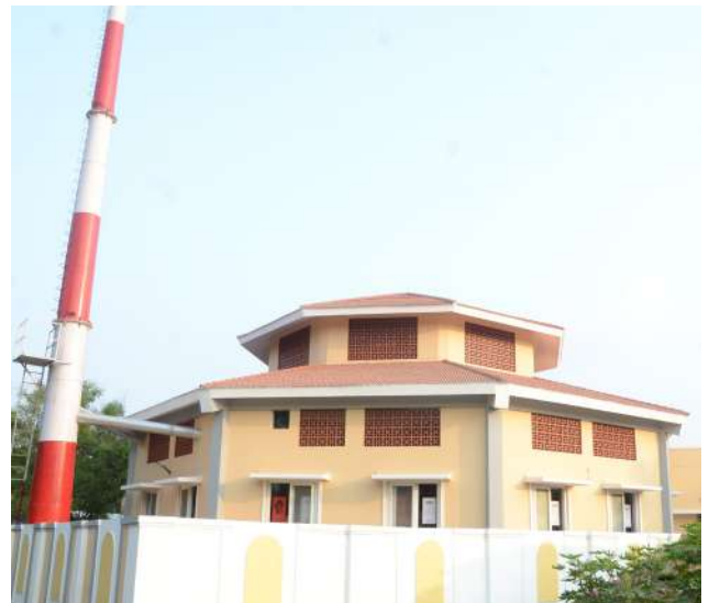
LPG Crematorium outer view

The newly constructed crematorium structure looks so unique that one passes by it, feels like a monument standing at the corner of the road.