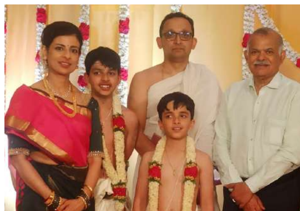
A glimpse of photographs taken during the function